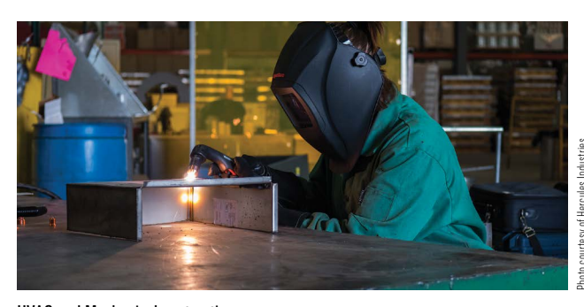
HVAC and Mechanical contracting

Property/plant maintenance, fire and rescue, general fabrication, plus: