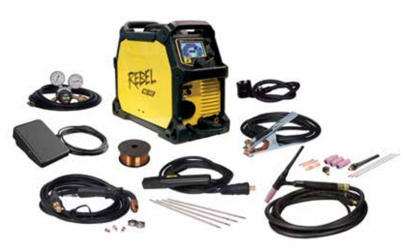
Rebel EMP 205ic AC/DC and accessories.